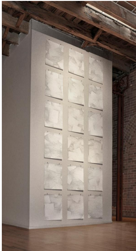
Installation view of Falling at Cecilia de Torres Gallery, New York