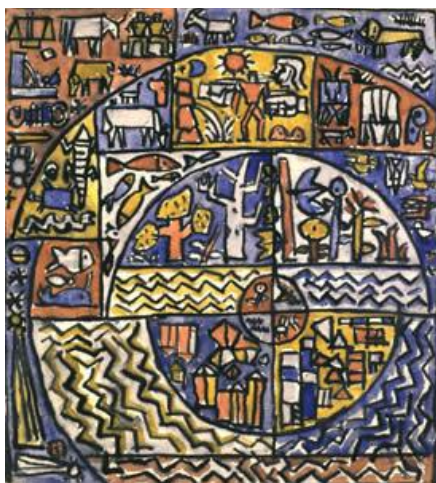
Genesis, ca.1955, watercolor and ink, 5¼ x 5 in.

After Torres-García's death, Alpuy wanted to leave Montevideo; he often went to Buenos Aires where he painted and completed a sketchbook of vibrant Buenos Aires street scenes.