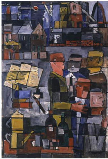
Dortmund, 1959, oil on canvas, 48½ x 34½ in.