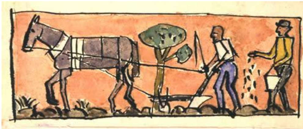
Rural Scene, ca.1950. ink on paper, 3 x 7½ in.