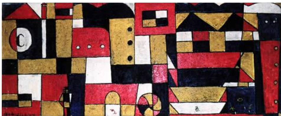
Mural, 1944. Hospital St. Bois, Montevideo.