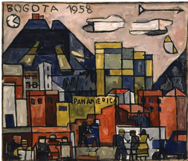
Bogotá, 1958. Oil on canvas, 25 x 29½ in.