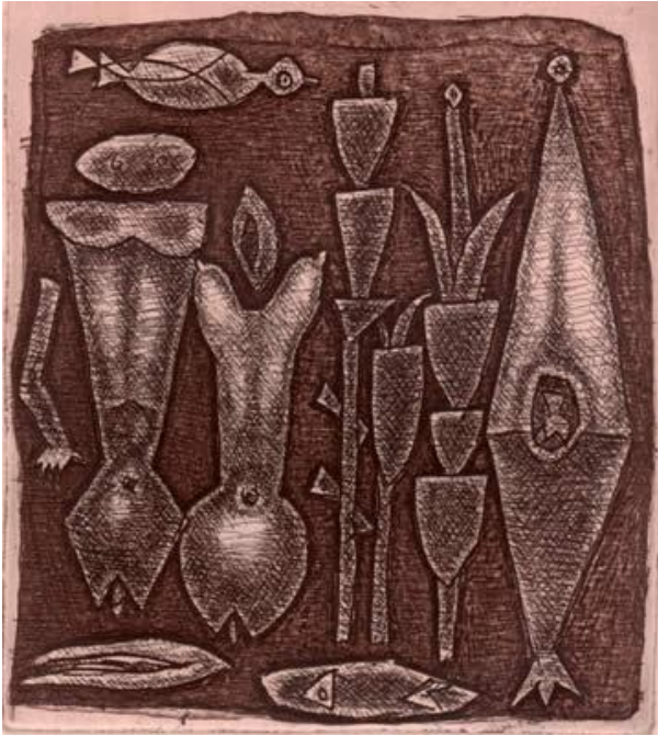
Arquetipos No 1, 1978. engraving, 5½ x 5 in., 14,4 x 12,5 cm.