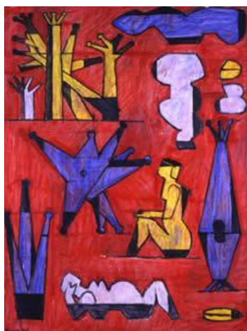
Composition in Primary Colors, 1996. Oil on canvas, 47½ x 35 in., 121 x 89 cm.