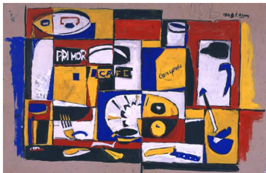
Still Life in Primary Colors, 1948. tempera on board, 17¼ x 27¼ in.