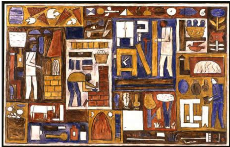
Oficios (Crafts), 1955. oil on canvas, 39¼ x 62¾ in.

He also painted murals in other private homes, for a furniture and design store, in the Liceo Larrañaga a large mural of figures practicing different crafts and professions, and, for the YMCA in 1956, he painted a large mural illustrating various sports.