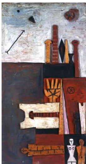
Marina Norte, 1962. oil on carved wood, 46 x 23 in.