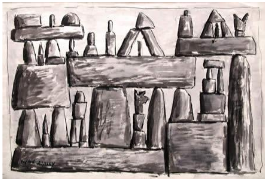
Monumento, 1946. watercolor, 9¼ x 13¼ in., Davis Museum Collection, Wellesley College, Wellesley, Mass.