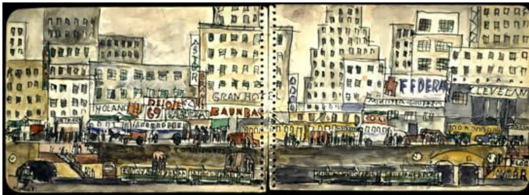
Buenos Aires, 1951, album central pages, ink and watercolor, 6½ x 18½ in.

The exhibition, Torres-García and his Workshop , opened in February of 1950 at the Pan American Union in Washington, D.C.