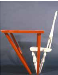
Untitled N°1, 1980, Painted wood chair & table, 37 x 22 x 22 in.

In 1980, continuing with the issues of perspective laid out in her early paintings of self portraits, Chilindron began to alter and intervene in the shape of basic furniture. To reflect the artist's point of view when sitting at a table she changed the length and angle of the table and chair. Chilindron was applying perspective to real space. In this example, Untitled Perspective № 1, the vanishing point is below ground, centered under the chair, and the furniture legs altered in order to convene at that point. These sculptures not only relate to daily life, interior and intimate, but also to the centrality of the human body and its relation to the surrounding domestic environment.