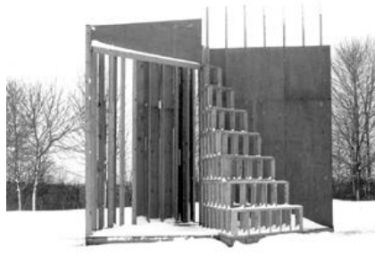
Opus I, 1987, Wood, 14 x 15 x 15 feet