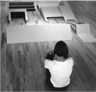
Untitled, N°10, 1985 - 1995, Installation at Cecilia de Torres exhibition: 65 years of Constructivist Wood