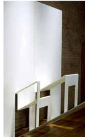
Untitled N° 114, 1998 Four Artists: Constructivist Roots exhibition, 1998 at Cecilia de Torres, N.Y.

In 1998, Chilindron began making collapsible sculpture, N° 114, shown in Four Artists: Constructivist Roots , at Cecilia de Torres Ltd, consists of a table and chair cut out of white Gator-board. As it is opened, the table and chair materialize in three dimensions; when closed flat, it becomes a large square abstract composition. This was her first use of hinges to allow movement, and that enabled the viewer to see its consecutive shapes in various stages as the piece unfolded. In a review of the exhibition, Robert C. Morgan wrote of N° 114: It is a purist work, that is, a highly refined form of constructivism. It carries the lightness of a De Stijl painting, but without all the sturm und drang.... Chilindron serves us a more stark version of reality, a Neo-Platonic exegesis that circumscribes the everyday world, yet is firmly entrenched within it. Her work distills the everyday hard edge, domestic environment into a vision of simplicity and ecstatic delight. Robert C. Morgan, Review magazine, June 15, 1998