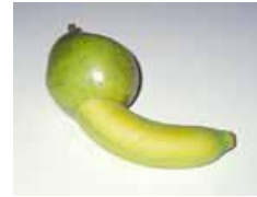
Pear-Banana, 1994 Photograph

In a series of photographs done in 1994, Chilindron documented her research to find out whether different shapes could fuse into the other's space. She worked with real fruit, combining for example a banana and an apple, to create new kinds of fruit. These images confound our perception of known things.