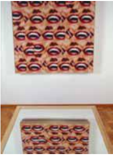
I love to look at myself, 1994, IBEU, Rio de Janeiro, installation