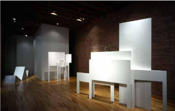
"Dimensions" 1997 exhibition at Cecilia de Torres, N.Y.

For "Dimensions" in 1997, a solo exhibition at Cecilia de Torres, Chilindron further explored the treatment of domestic environments, compressing the depth of a large cluster of stylized shapes of a table, a chair, sideboard, and leaving the other dimensions, height and width, untouched. Mónica Amor in her review of the show for the magazine Art Nexus, (Nº 25, July-September 1997), described Chilindron as a spatial trickster , she undermines the certainty of the three dimensionality of objects upon which architecture and furniture are predicated and aims to experiment beyond the functional requirement. .. Hers is a project located at the border between imagination and "reality," between perception and conception. So these pieces remind us in a certain way, of a "poetics of space."