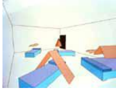
Dreams, 1994, IBEU, Rio de Janeiro, sketch for installation