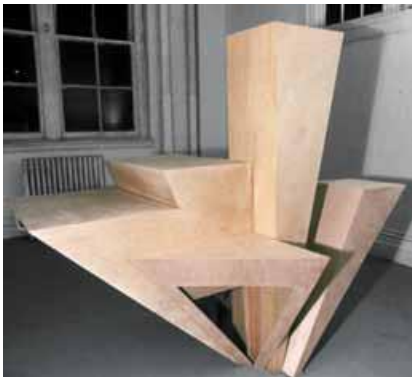
Untitled, 1985, Mahogany