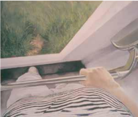
The Door, 1978, Acrylic on canvas 30 x 36 in.