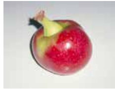
Apple-Banana, 1994 Photograph