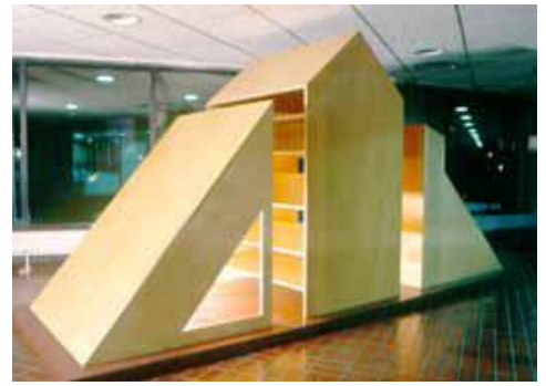
Opus II, 1987, Wood