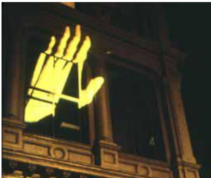
Touched By Light, 1992 Projection

In the 1990s Chilindron worked in collaboration with the Argentine conceptual artist Eduardo Costa. In 1992, their project "Touched by Light," received considerable attention. They projected the image of a hand onto the façades of Manhattan buildings from a moving truck, and as they drove through the streets the engaged public saluted the giant hand as it changed colors.