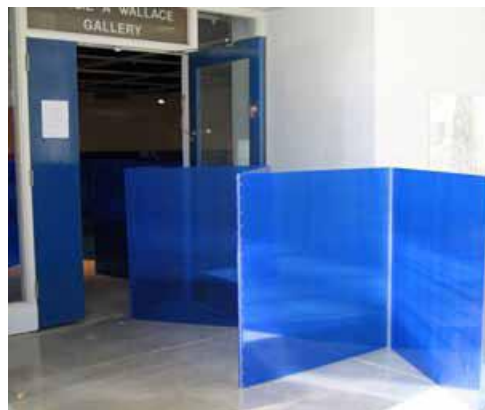
Blue Cube, 2006, Sculpture in Four Dimensions , exhibition at SUNY, Old Westbury, New York