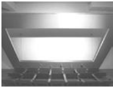
Cinema Kinesis, 1999, 11x16x11 foot moving, sculpture, El Museo del Barrio, New York

an 11x16 foot screen were built of aluminum girders and covered in grey PVC. Linked together and motor powered, the rows of chairs and the screen lowered into a flat plane and then rose again as one, to the vertical position of 90°, only to reverse and in continuous motion slowly recede to the floor.