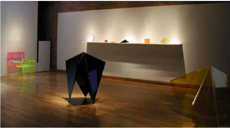
Recent Works, 2004, exhibition at Cecilia de Torres, New York

An exhibition of New Work at Cecilia de Torres Ltd. featured transparent color works and maquettes of a new series of forms. The Blanton Museum of Art acquired Fibonacci Triangle , 2004.