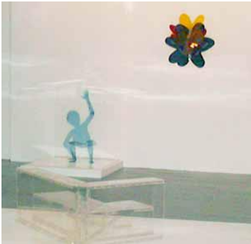
Dot Galerie 2001 exhibition, Geneva, Switzerland

In 2000 starts working with transparent and then colored acrylics. For Chilindron adding transparency as a new element, allowed her to get closer to her original idea of a piece, as each shape can be seen through. These new works were first seen in a solo show at Dot Galerie in Geneva, Switzerland in 2001. La Ville de Genève (Geneva's Municipality), purchased "Table and Chair," from the exhibition. Several pieces then traveled to Holland for a show at Kapel Central, Nijmegen, Netherlands.