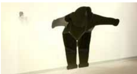
Golem at Point of Contact Gallery, 2008, Borges Homage exhibition, Syracuse, New York

2010 Solo exhibition at Alejandra von Hartz Gallery in Miami.