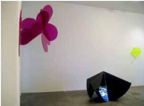
Installation at Laura Marsiaj Gallery, 2008, Rio de Janeiro, Brazil

2008 traveled to Rio de Janeiro for a solo exhibition at the Laura Marsiaj Arte Contemporanea Gallery.