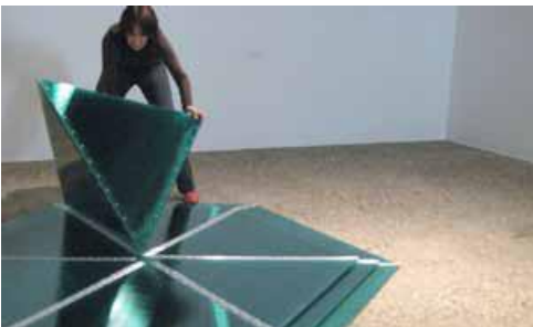
Pyramid, 2006, Sculpture in Four Dimensions , exhibition at SUNY, Old Westbury, New York

Jonathan Goodman wrote: Cube 48-Blue , 2006, is composed of 76 48 x 48 inch panels, which expand to a length of 304 feet if displayed sequentially in a line; if folded down, the panels create a cube 48 in. in all dimensions. Inevitably the piece turns on itself because gallery spaces cannot contain it. In this show, the blue synthetic squares, translucent and capturing light, were folded in some places like an accordion to conform to the dimensions of the space.