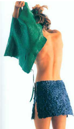
Cuerpos pintados, 1994, Acrylic painted garments