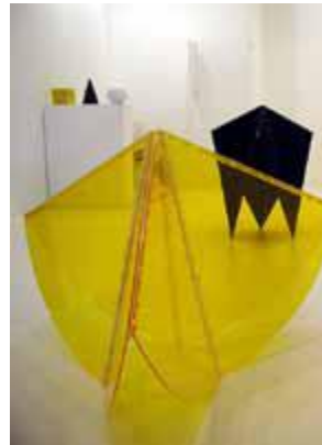
Psychogeometries installation, 2004, at Arco, Madrid Spain

2006 Traveled to Doha, invited to show her work at the Virginia Commonwealth University School of the Arts in Qatar. The exhibit featured work that dealt with real and mental space and the way in which our minds process experience.