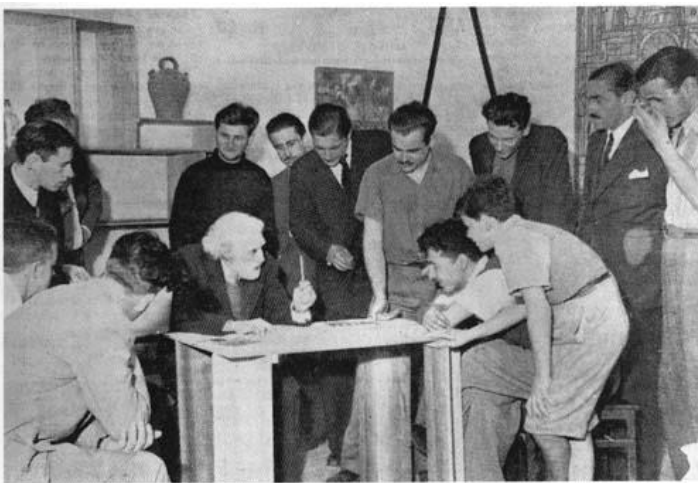
Torres-García and his students, 1947

Following his 1934 return to Uruguay after a 43 year absence, Torres-García first organized the Association of Constructive Art (AAC). He soon realized how culturally dependent his compatriots were on Europe. He challenged this attitude by claiming "Our North is the South" in his 1936 "School of the South" manifesto. Accompanying his declaration he drew the map of South America upside down, a masterpiece of conceptual art avant la lettre .