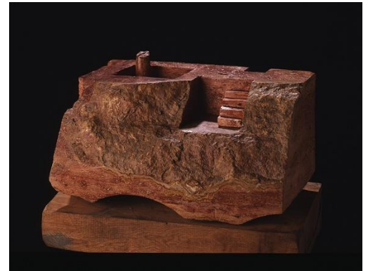
Gonzalo Fonseca, Situ , 1986 Persian travertine 10½ x 15 x 9 in. 26 x 38 x 23 cm.

Exhibited are works in diverse materials: Couple a wood assemblage of 1960, and an incised white gesso relief from 1962.