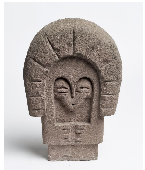
Horacio Torres, Idol , 1939 Pink granite 20 x 12 in. 51 x 30,5 cm.

Accordingly, in the eighth exhibition of the Association of Constructive Artists (AAC) in 1940, a variety of works of applied art in a variety of media were presented side by side with painting and sculpture. Horacio Torres' Idol in pink granite was in that show as was Torres-García's 1937 painting Composición universal , now in the Centre Pompidou. Later that painting was rendered as a tapestry in black wool on white cotton, by TG's widow Manolita, daughter and friends. From then on, many TTG exhibitions combined ceramics, furniture and textiles with paintings.