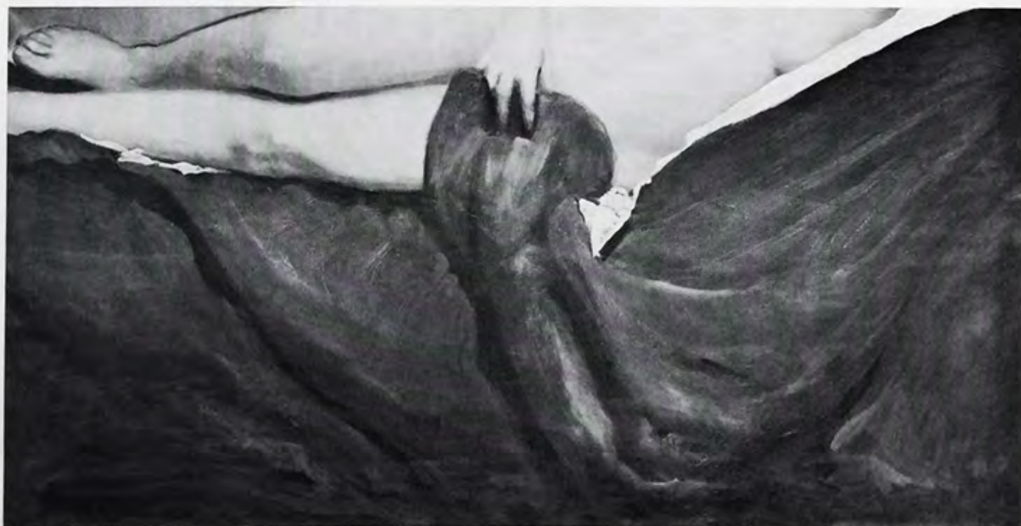
Reclining Nude , 1972. 30" × 60". Goldowsky Gallery