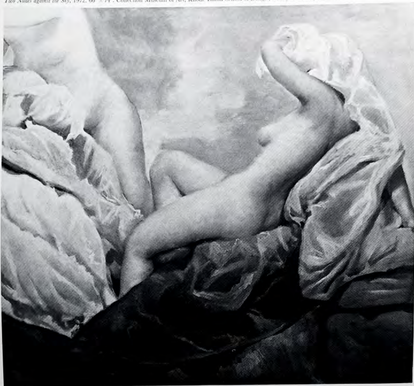
Two Nudes against the Sky , 1972. 66" x 74". Collection Museum of Art, Rhode Island School of Design; Nancy Sales Day Collection

In this way Torres forced a modernism into his pictures—forced himself to deal with more modern issues. And "forced" is the proper word here, for Torres' main allegiance is to tradition. Hence a tension characterized his art—the result of a struggle between the romantic Spanish tradition of dark painting and modernism but also, to a lesser extent, between Italianate idealizing tendencies and this same modernism. Much of the vitality of Torres' work derives from this struggle; love of the past and fear of anachronism are in conflict, and this conflict is a challenge to his imagination. A modern feel is achieved personally and "against the grain" as it were, and in ways that do not violate or vulgarize his sources. On the other hand Torres has chosen