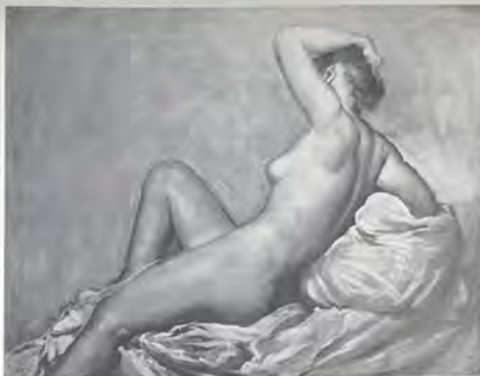
Reclined Nude on Blue Background , 1973, 54" x 72". Goldowsky

The conventional poses are frequently pressed into profile so that the picture develops laterally across the surface rather than back into depth. This compression is accentuated by the composition; usually a simple diagonal movement not balanced by a counter movement from within but dependent on the area of