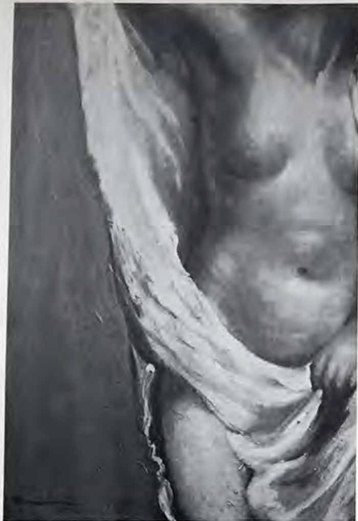
Female Torso with White Draperies , 1972. 37" x 24 1/4". Richard Gray Gallery, Chicago