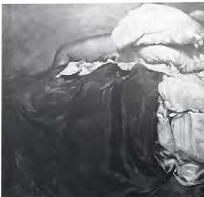
Fragment of Nude on Green , 1972, 57" x 62". Goldowsky