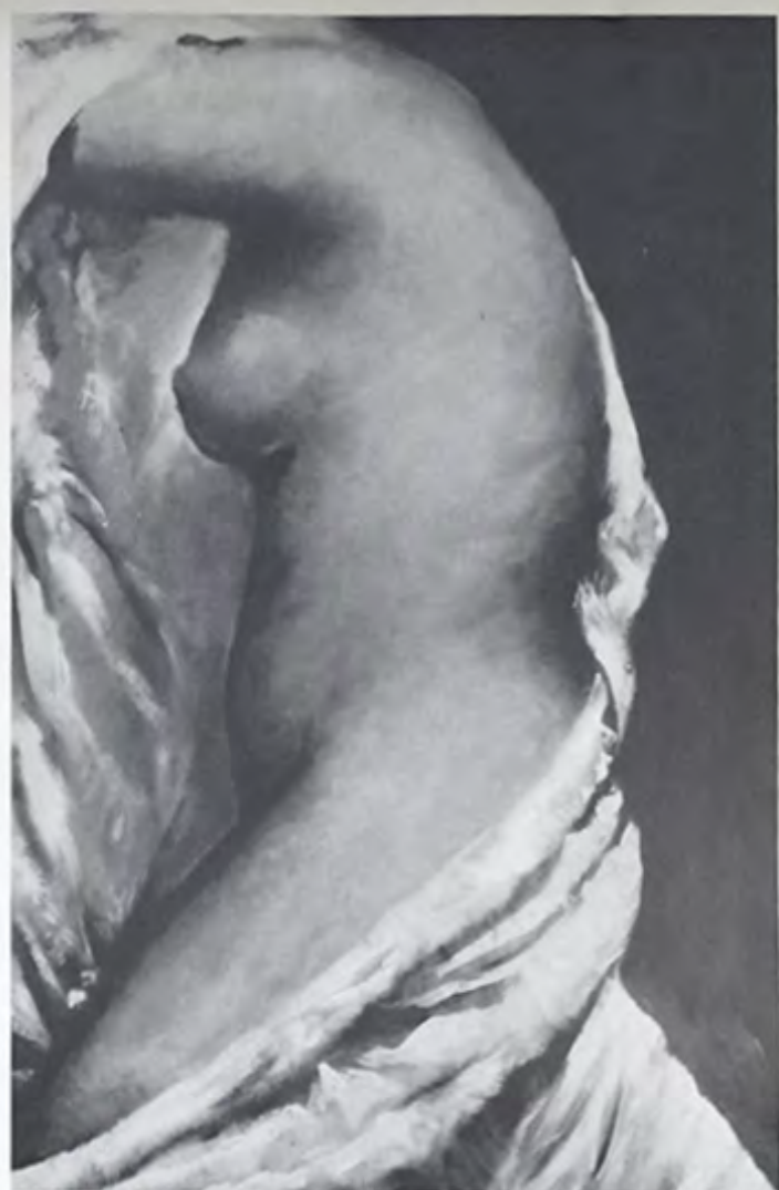
Profile , 1972. 36" x 24". Noah Goldowsky Gallery, New York