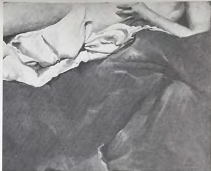
Resting Nude on Green , 1972. 36" × 45". Goldowsky Gallery

Of course the cropping off of heads and, to a less extent, other parts of the human form raises serious problems of expression. In certain of Torres' pictures—usually smaller canvases—the whole exists as a framed detail that has about it an abstractness and a satisfying completeness despite the fact that essential parts of the figure are missing. In other cases the figure seems truncated and the picture is suspended between the abstract justness of composition and a certain sense of arbitrariness. The latter is something Torres has had to accept at least temporarily for the sake of the presence and particular feeling that the full-bodied nude can convey (and which, above all else, he loves to paint). In certain pictures he has surmounted this difficulty by de-emphasizing the face in one way or another. But one feels that this problem is ultimately the traditional one of idealization; now, however, this problem must be approached from a distinctly modern angle: idealization for the sake of form. 8