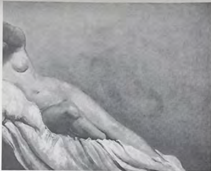
Figure on Red Background , 1973. 50" × 64". Goldowsky Gallery