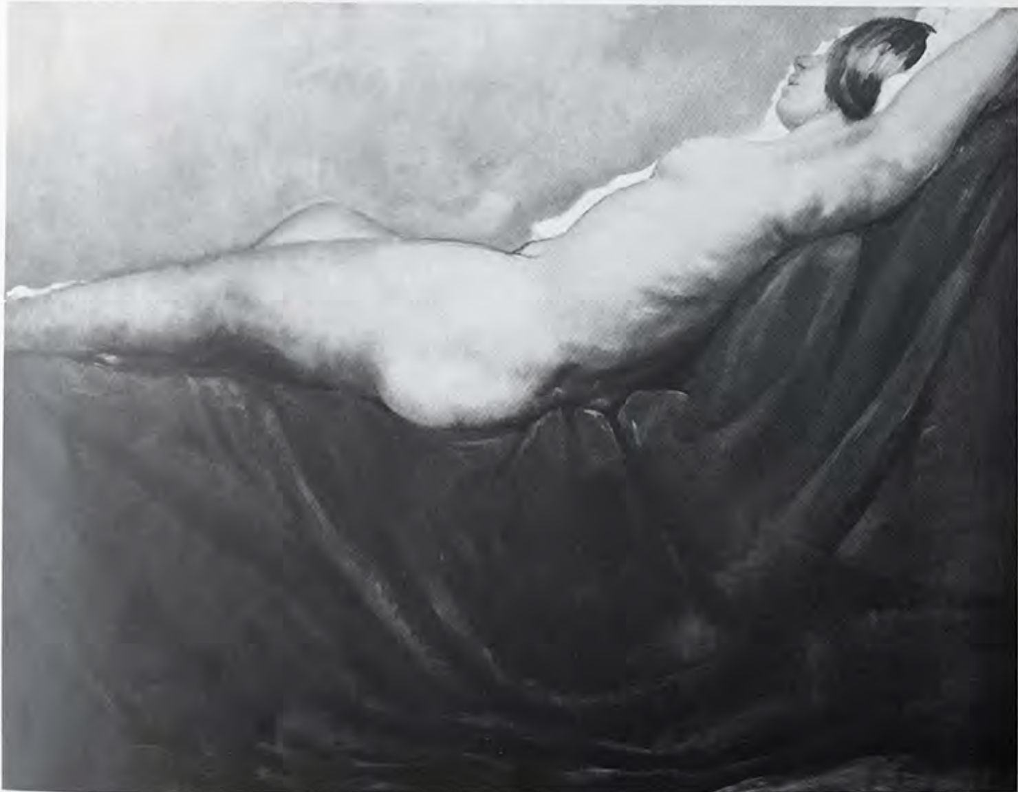
Torres, Resting Figure on Green , 1973, 52" x 68", Courtesy Noah Goldowsky Gallery, New York

If much or even most of the better painting today continues to be representational, the best abstract art has an authority and fullness about it which is not to be found in even the best representational painting. Torres comes closest to transcending this situation or at least to avoiding what I have called the thin,