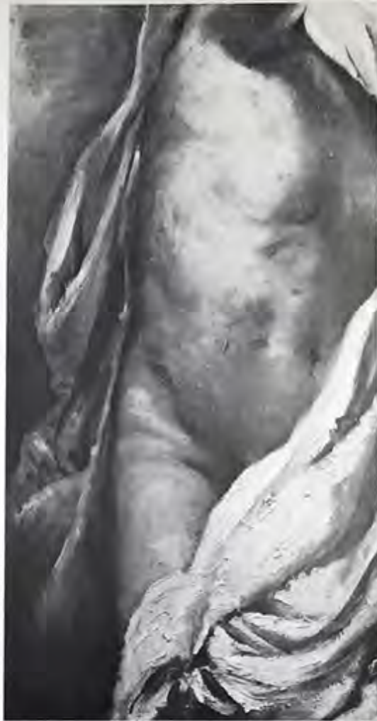
Torso , 1972. 42" x 22". Richard Gray Gallery, Chicago

As Arthur Pope has said: "When one comes to examine Venetian painting closely, one finds that the rendering of space is in fact accomplished largely by abstract means and not by an exact rendering of value and intensity relations . . .; and in spite of the general effect of large masses of light and shadow, the tone relations in individual fields depend more on exigencies of pigment material and technical procedures and design than on any attempt at accurate naturalistic rendering of tone relations." 3