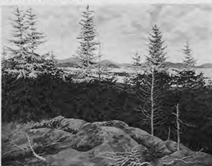
Neil Welliver, Shadow over Zeke's , 1974. Oil, 72" x 96". By courtesy of Allendale Insurance, Rhode Island

One obvious example of this is Picasso's neo-classicism of the 20's, which was based not on a revival of any specific classical idiom but rather on a general feeling for style. Picasso perceived that one cannot merely present the chosen past but must also include our distance from it; yet he wished to do this in such a way that the essential "feel" was traditional—in this case, antique, not modern. Taking his cue from Puvion de Chavannes, who had preceded him in this, Picasso made the modern distance a psychological one, a nostalgia for a lifeless past, a silent and