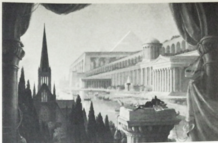
Thomas Cole, The Architect's Dream , 1840. Oil, 54" x 84". Collection: The Toledo Museum of Art

As a result the representational painter finds himself not only without style and alienated from his own tradition but also