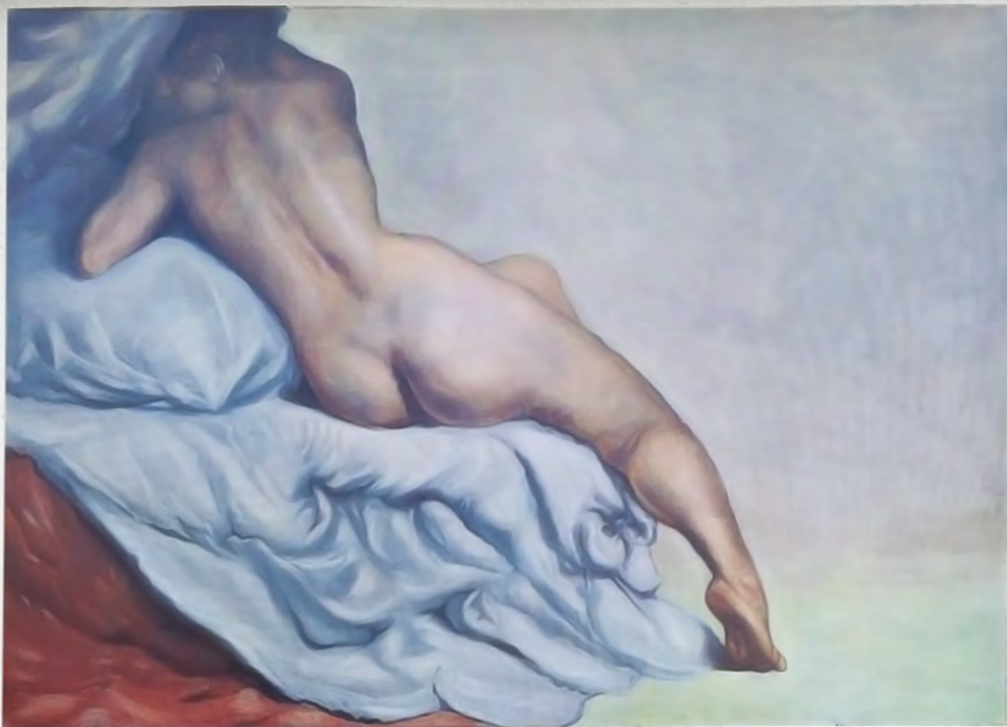
Nude. Oil on canvas, 60" × 84"

Nude on Green Background , 1973. Oil on canvas, 66" × 96".